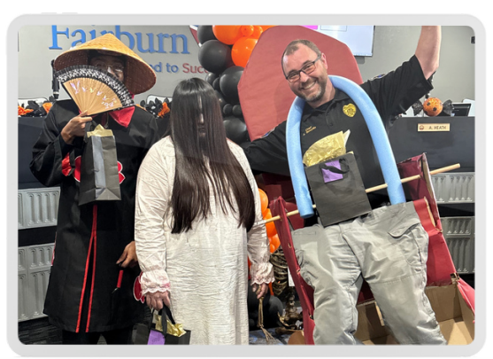
Winners of the Spooktacular Costume Contest